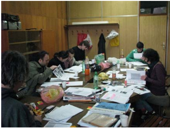
Figure 3. Workshop in Banja Luka, Spaport 2010

the library also started to incorporate textbooks from some neighbouring countries such as Albania, Greece and Bulgaria.