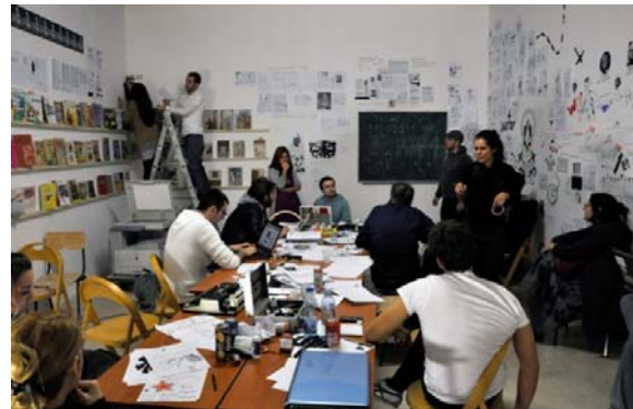
Figure 4. Workshop in Belgrade, 52 October Salon, 2011

Another aim of this library consists in organizing workshops, in which different textbooks from the library are compared and analyzed, and collaborative work and a creative practical approach result in the compilation of new publications. Through direct translation, interpretation, visual, linguistic and literary analysis of selected materials from very personal perspectives and experiences, workshop participants create new content using the technique of assemblage.