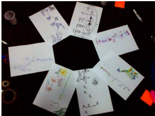
Figure 6. Different personal timelines converging in the 'common ground' that is temporarily set up for the duration of the workshop.

In this way, participants increase their awareness of how we - as subjects of historical events and their representations - are shaped as individuals. But it is still hard to get a grip on how this relationship works in the opposite direction: how we as individuals actively or passively contribute to the events that happen on a larger scale, and how we influence the creation or recreation of certain official narratives. This is still a pending task for future workshops.