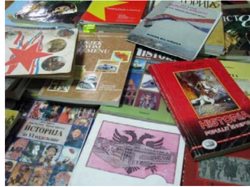
Figure 2. Examples of textbooks from the Disputed Histories Library